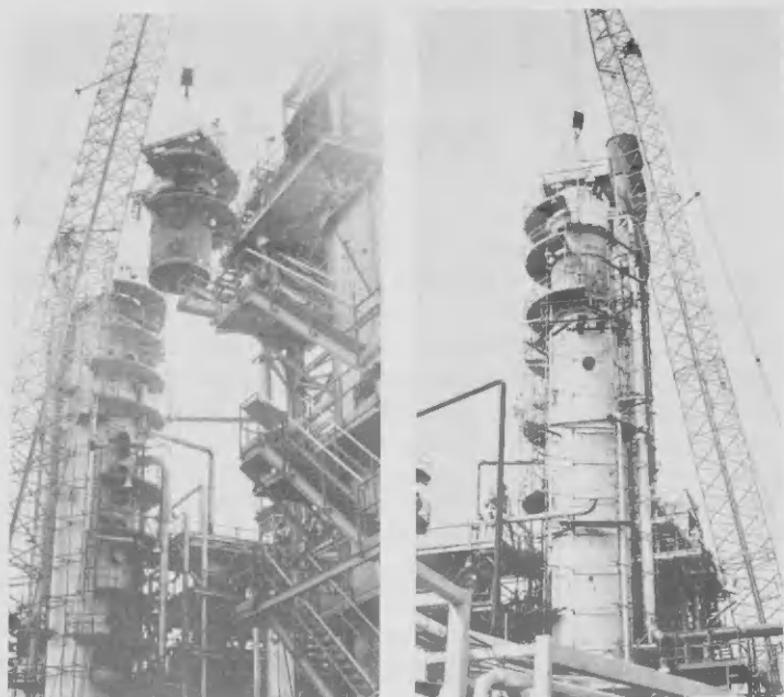
As one of the mayor activities in the recent Pipestill No. 5 turnaround, 111 feet of the Kero Stripper was replaced for a new section.